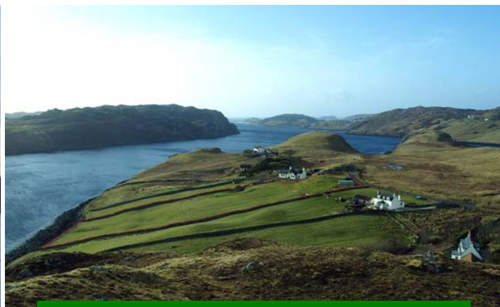
Looking west across Rhuvolt peninsula towards Atlantic. House site and adjoining croft land are outlined in red.

Overview: A most desirable de-crofted house site situated in a sunny elevated position affording fantastic views with Outline Planning Permission for one dwelling in an unique location on the southern shores of Loch Inchar. The house site, roughly square in shape, extends to approximately 0.115 hectare. The adjoining croft land extends to approximately 0.792 hectare.